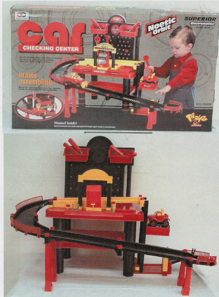
PHOTOGRAPH(S) OF THE SAMPLE FOR THE TEST